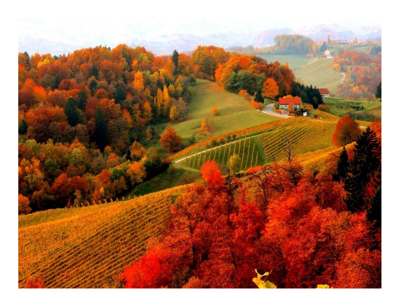
"He who supplies seed to the sower and bread for food will supply and multiply your seed for sowing and increase the harvest of your righteousness." 2 Corinthians 9:10 (ESV)