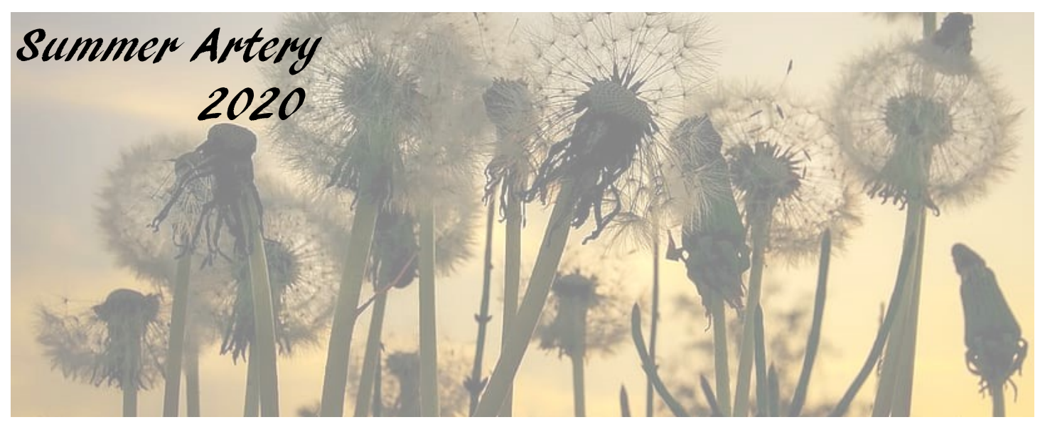
"Then Israel sang this song, Spring up, O well; sing ye unto it."